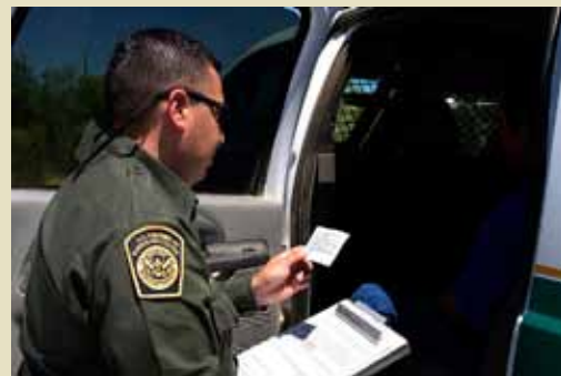
Border Patrol agent reads the Miranda rights to a Mexican national arrested for transporting drugs.

In Miranda v. Arizona , the U.S. Supreme Court rules that the right against self-incrimination is not limited to in-court testimony, but also applies when a suspect is taken into police custody for questioning. Before any questioning can begin, police must explain that the suspect has the right to remain silent, that any statement he does make may be used as evidence against him, and that he has a right to the presence of an attorney, either retained or appointed. The court refuses to accept as evidence any statements made after the right to remain silent has been invoked. These mandatory statements by police are known as Miranda rights and the process of informing is known as Mirandizing.