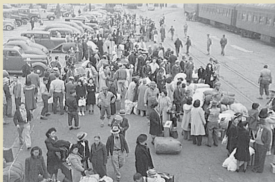
Japanese Americans being evacuated from West Coast areas

In the wake of Japan's attack on Pearl Harbor, Congress passes a law requiring Japanese Americans to live in restricted areas and obey curfews. In the case of Hirabayashi v. United States , the U.S. Supreme Court rules that this is not a violation of the Japanese Americans' Fifth Amendment right to due process, as they may have divided loyalties during wartime and their segregation is necessary to protect national security.